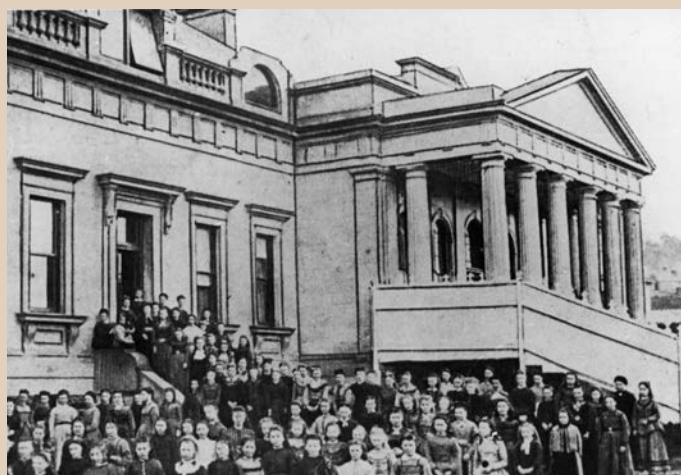
OGHS students safely on their side of the wall in 1871.

I wonder however, how the school authorities prevented the ‘clandestine correspondence’ and other liaisons occurring when school finished for the day. How did they manage to keep the girls and boys separate “after hours”? Did the schools finish at different times, were the male and female students chaperoned from school in different directions, or were they encouraged to exit via various routes?