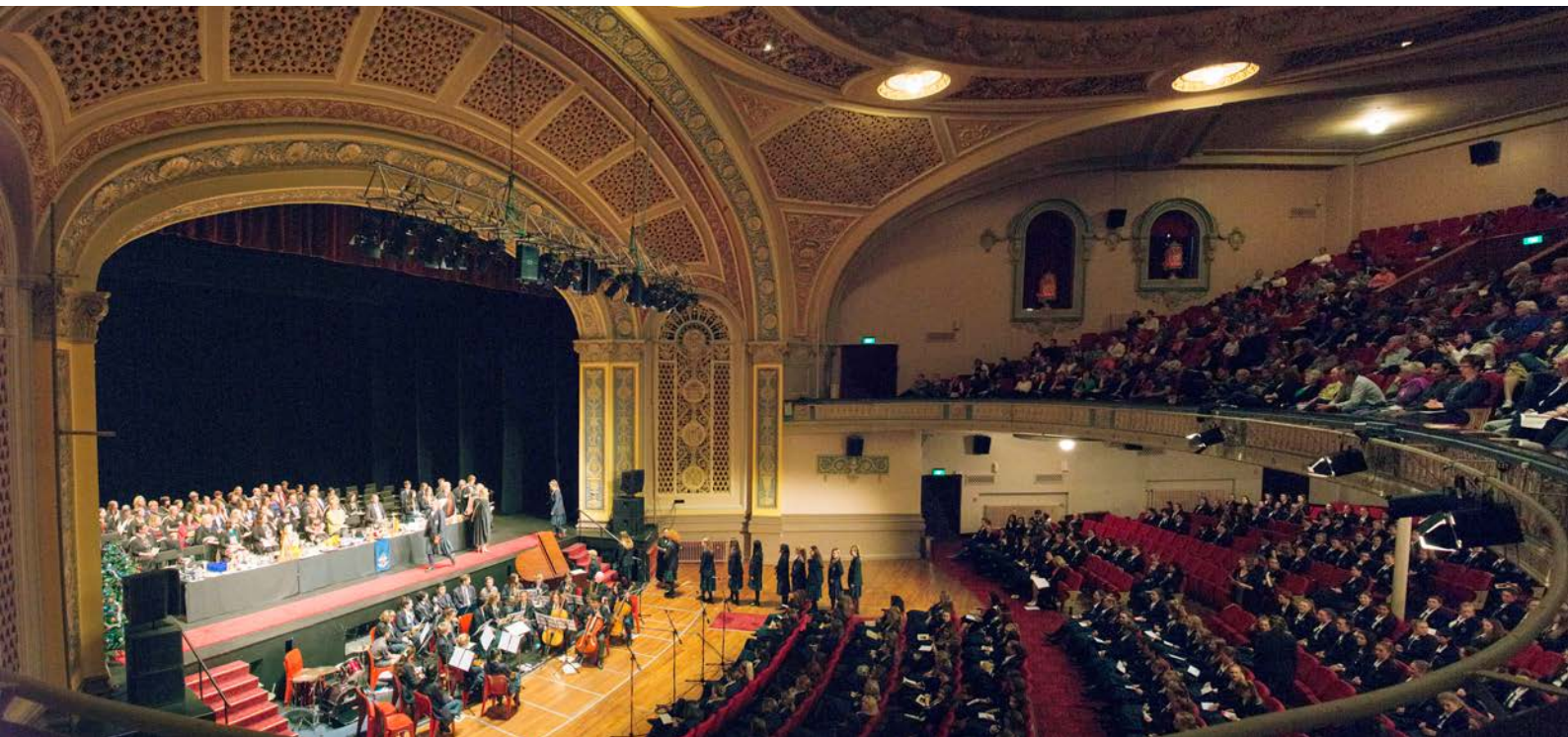
Photo: OGHs prizegiving, Regent Theatre, 2014. (Ian Thomson, FPSNZ)